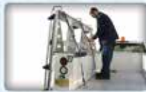
Pick-Up Mounting Straps