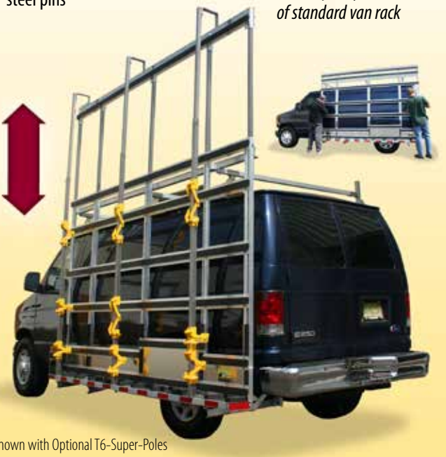
Shown with Optional T6-Super-Poles

All the quality features of standard van rack