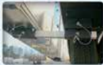
Detachable Underbody Mount