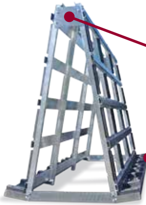
Compact and Durable

Four point top braces for strength and rigidity