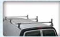
Van/Sprinter Roof Rack Mount