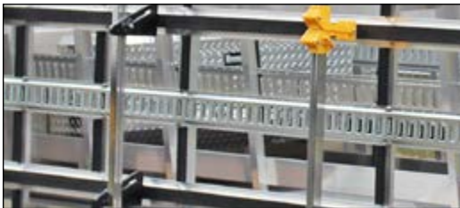
E-track cargo control system on interior or exterior racks