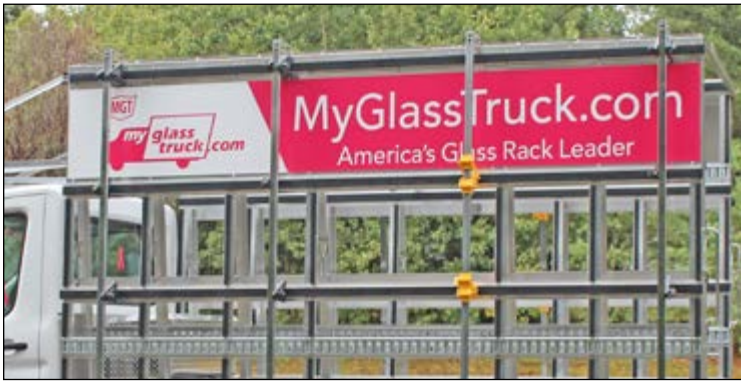
Sign panel with graphics