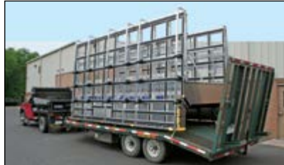
ATLAS body installed at our facility or delivered to your location