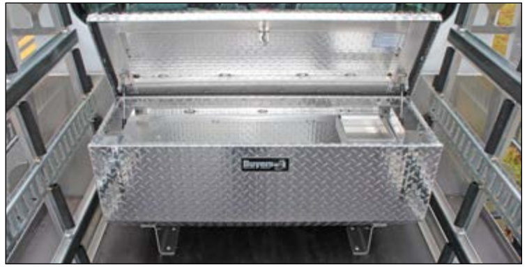
Tool box behind cab with additional storage underneath