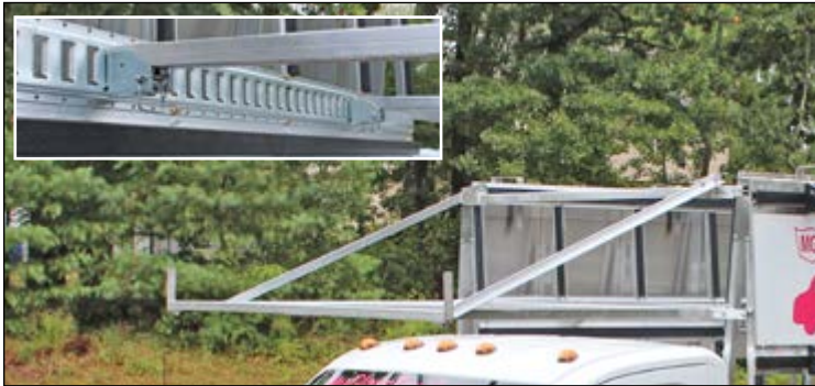
Over-the-cab metal carrier with adjustable cross-bars