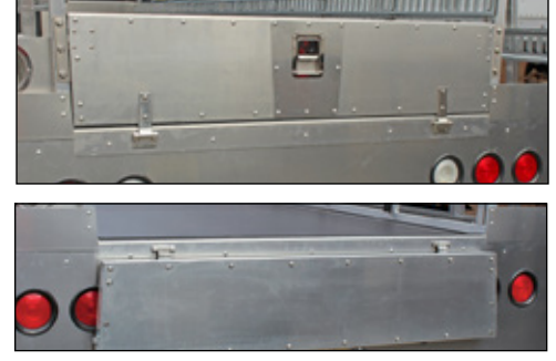
Fold-down tail gate