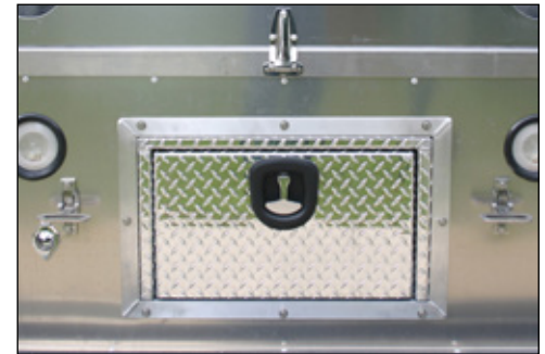
Integrated tool box