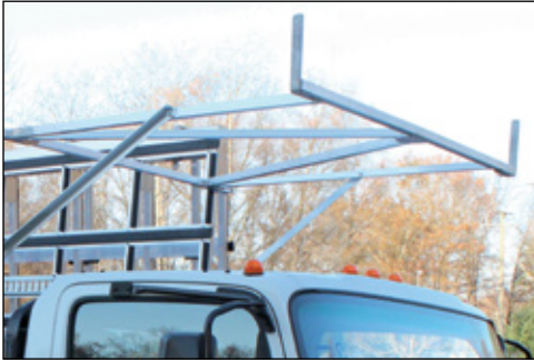
Over-the-cab metal carrier