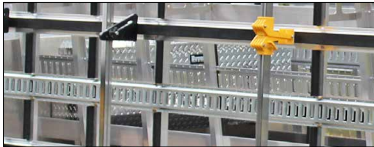
E-track cargo control system on interior or exterior racks Also shown: Adjust-A-Pole and Super Pole