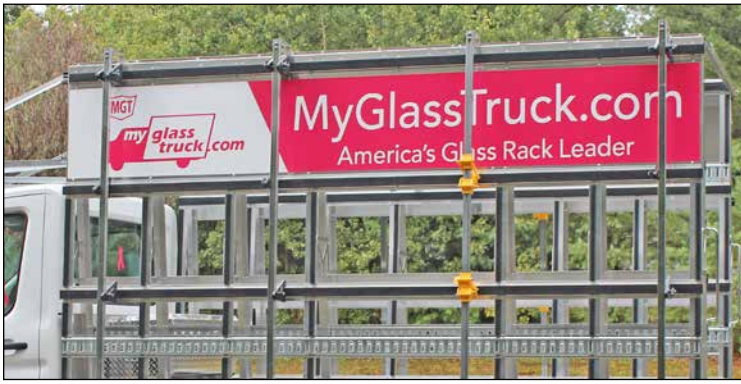
Sign panel with graphics