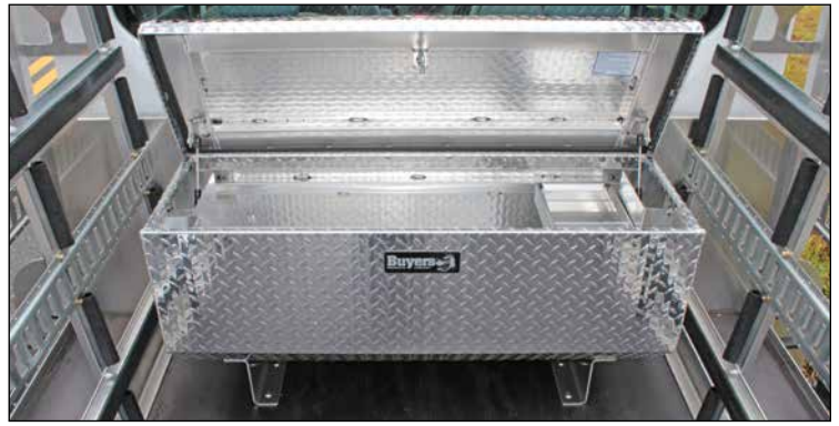
Tool box behind cab with additional storage underneath