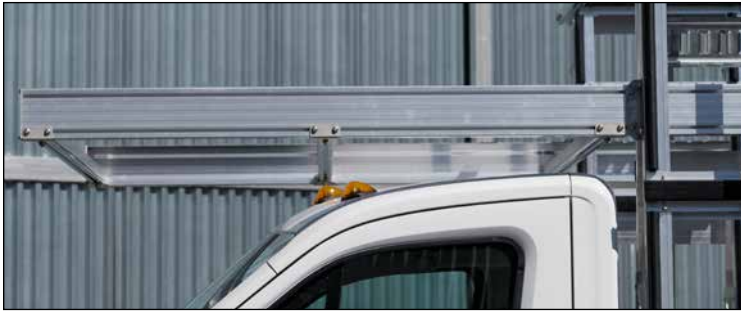
Over-the-cab metal carrier with adjustable cross-bars