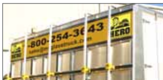
Optional Sign Panel