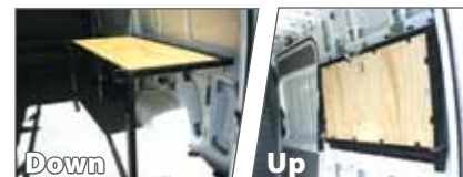
Optional Fold-Down Work Table

Superior Fabrication with Huck® Aircraft-Grade Mechanical Fasteners