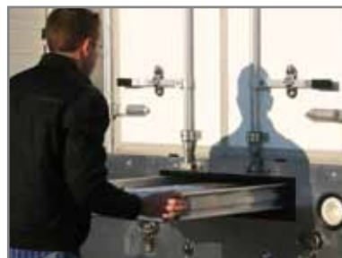
Ramp self-stores when not in use

Standard KoskiCrown floor with slip-resistant surface