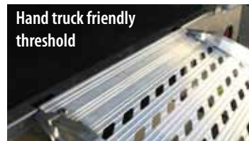
High traction surface - Dirt falls through