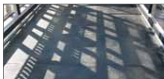
Standard KoskiCrown Floor