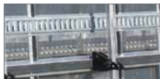
Optional E-track System