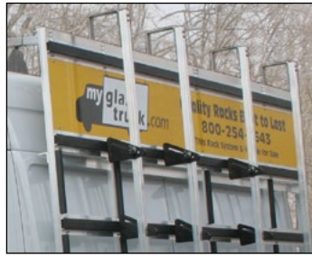
Sign panel with graphics