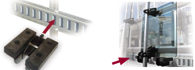
Transport glass on upper portion of rack when the bottom ledge is occupied. Row of E-track required (sold separately)