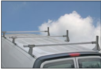
Roof rack for mounting glass rack