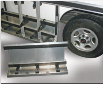
Removable wheel skirt for hassle-free tire changes