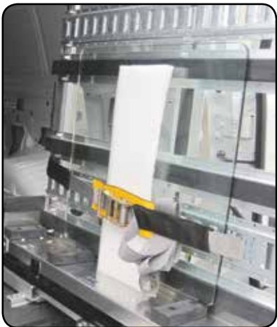
Includes two rows of E-track and two cargo control straps