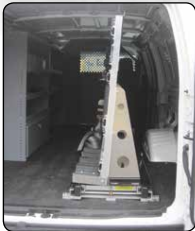
Cargo and glass are accessible when rack is inside vehicle

No More Crawling or Climbing to Load and Unload!