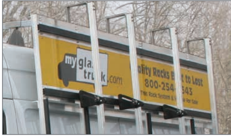
Sign panel with graphics