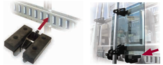
Transport glass on upper portion of rack when the bottom ledge is occupied. Row of E-track required (Sold Separately).