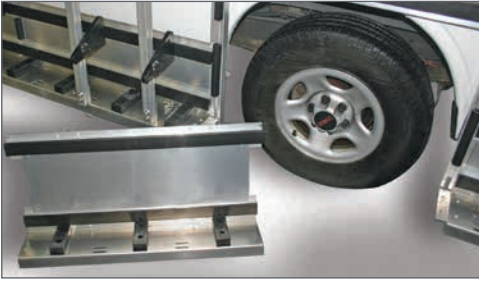
Removable wheel skirt for hassle-free tire changes