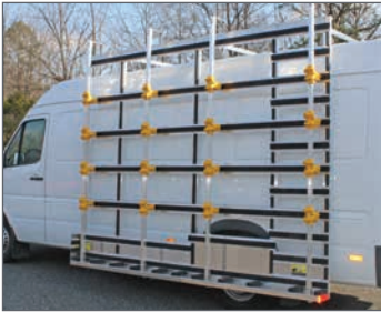
Slat ladder for easy access to optional roof rack