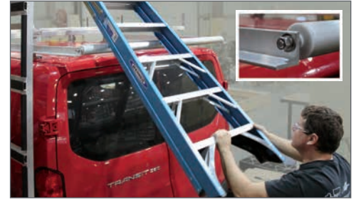
"Load-EZ" roller bar assists with loading to roof rack