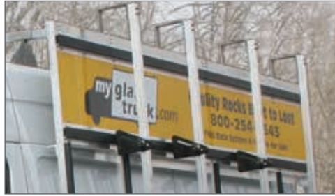
Sign panel with graphics