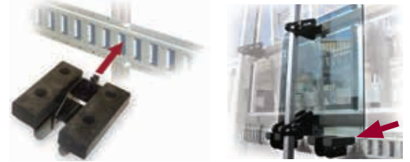
Transport glass on upper portion of rack when the bottom ledge is occupied. Row of E-track required (Sold Separately).