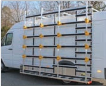
Slat ladder for easy access to optional roof rack