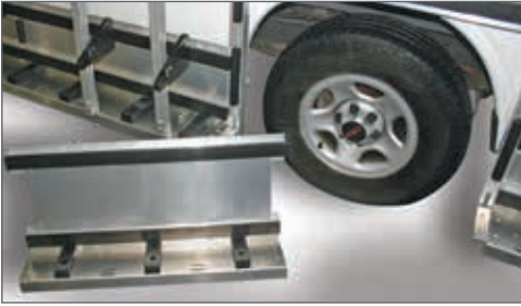
Removable wheel skirt for hassle-free tire changes