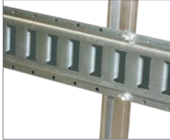
E-track cargo control system