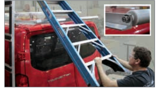
"Load-EZ" roller bar assists with loading to roof rack