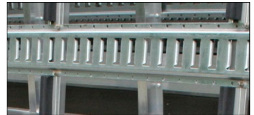
Optional E-track cargo control system