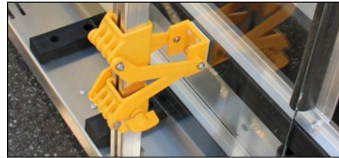
Optional Super-Pole: Fully adjustable, made from durable glass impregnated nylon