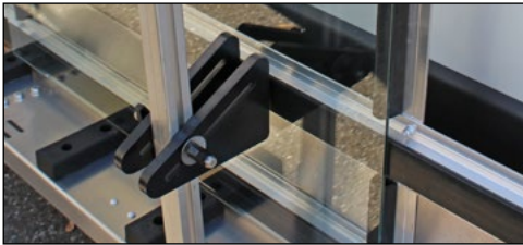
Standard Adjust-A-Pole: Fully adjustable, neoprene triangle cleats